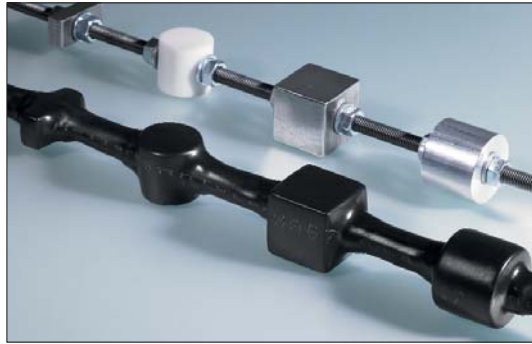
Due to the high shrink ratio HA67 is suitable for complex shapes and dimensions.