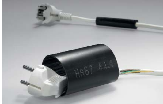
Ideal for applications with highly varying diameters like cable connector configurations.

Insulates, seals and protects large size differences between connectors and cables.